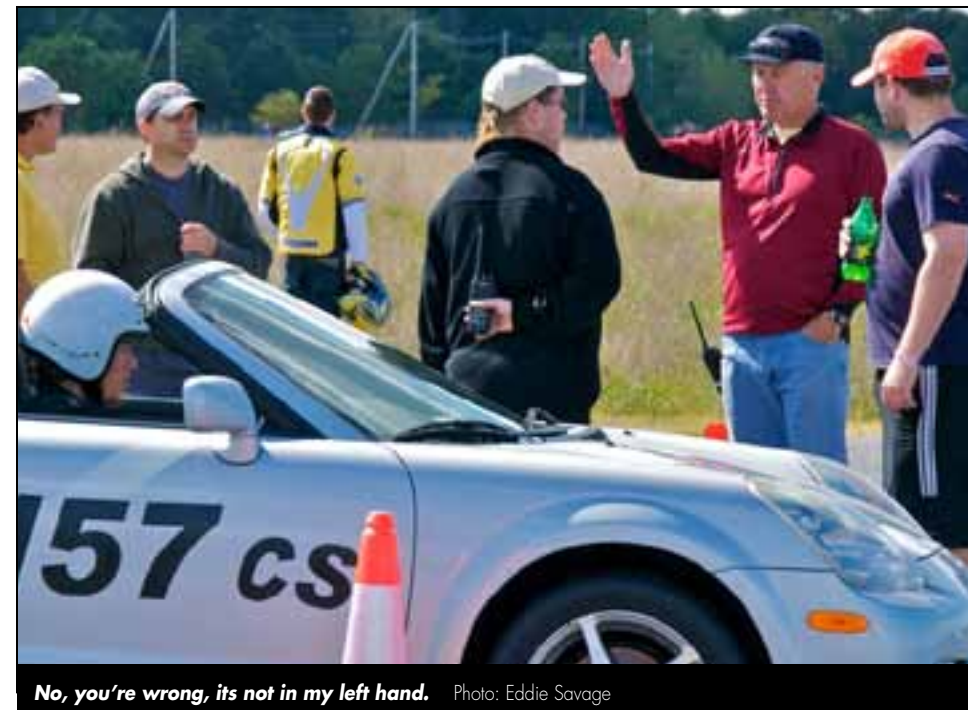
No, you're wrong, its not in my left hand.