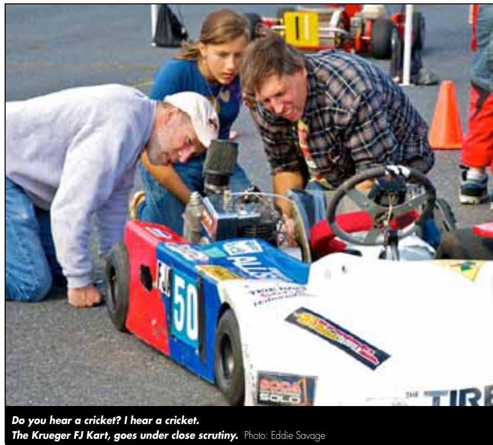
Do you hear a cricket? I hear a cricket. The Krueger FJ Kart, goes under close scrutiny.