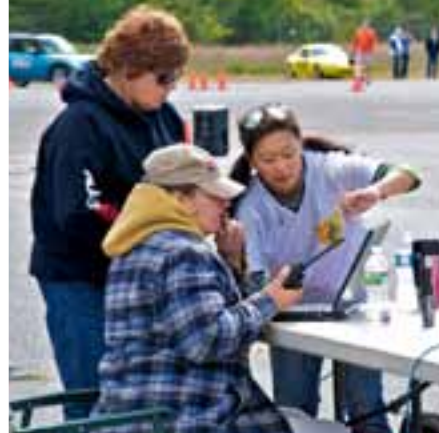
The problem is this imaginary point in space...