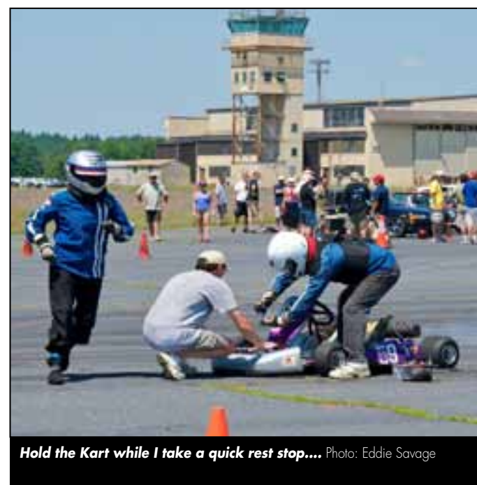
Hold the Kart while I take a quick rest stop....