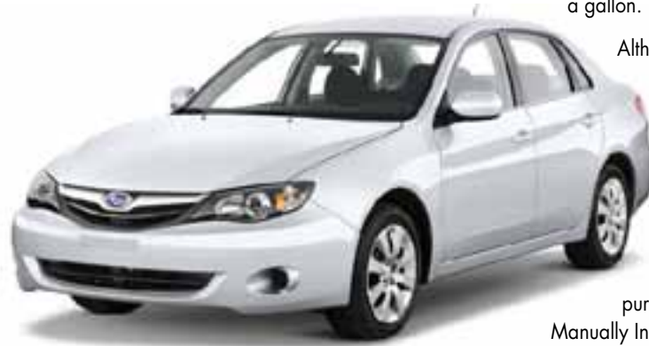
2011 Subaru Impreza 2.5i

On paper the Subaru appears to be superior. It has a 2.5 liter engine, which is half a liter more than the Lancer. It comes standard with all wheel drive, a locking differential, and four wheel disc brakes. It makes more power, more torque, has more options, and has more fancy abbreviations for clever electrical systems. All of this can be yours for $17,495. The Lancer, however, is available in front wheel drive only. Still, it will cost you $800 less, and squeezes more miles from a gallon.