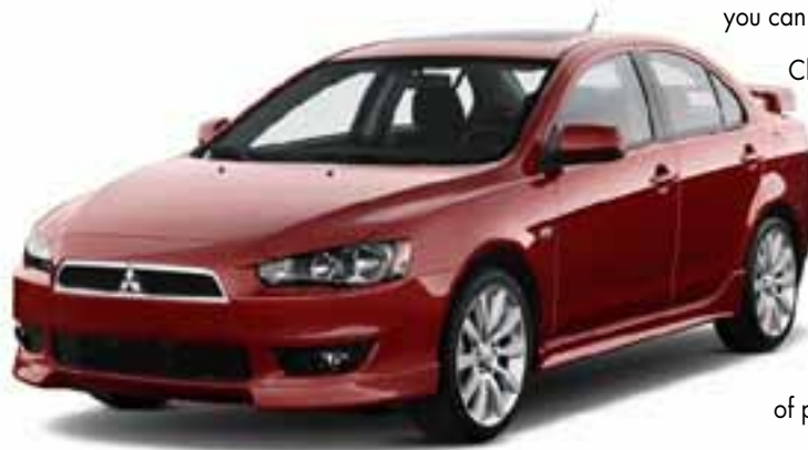
2011 Mitsubishi Lancer ES

This is by far the best entry level chassis I have ever driven. The low slung Subaru boxer motor is a key factor in reducing lateral weight transfer. This motor, symmetrical all wheel drive, and four wheel independent suspension is the single best combination I have yet to experience. Somehow this entry level Impreza soaks up every bump on the road, and yet corners so flat you can hardly tell you've asked the car to change direction.