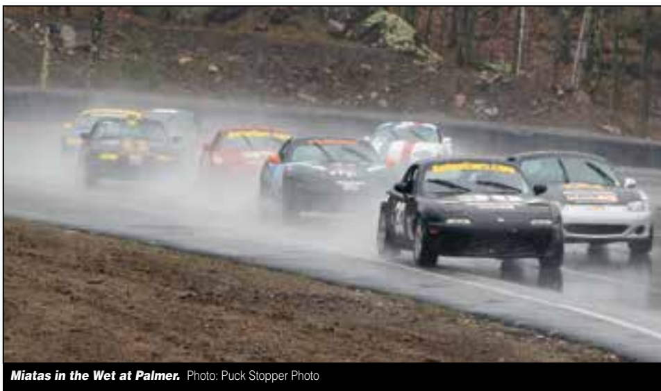
Miatas in the Wet at Palmer.