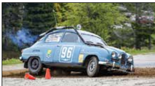
Mt Snow uniqueness in vehicles had to go to Bruce Turk's vintage Saab 96. It may be vintage but Bruce still drives it hard!