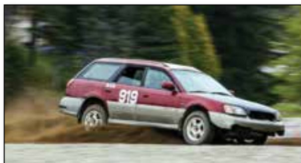
Dan Laurence took top spot in Modified -AWD by less than a second in the combined 8 runs.